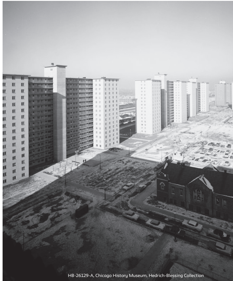
HB-26129-A, Chicago History Museum, Hedrich-Blessing Collection

Source: Color of Wealth in Chicago Survey Respondents for the Chicago Metro Region which includes the city of Chicago and 10 counties: Cook County, DeKalb County, DuPage County, Grundy County, Kane County, Kankakee County, Kendall County, Lake County, McHenry County, and Will County.