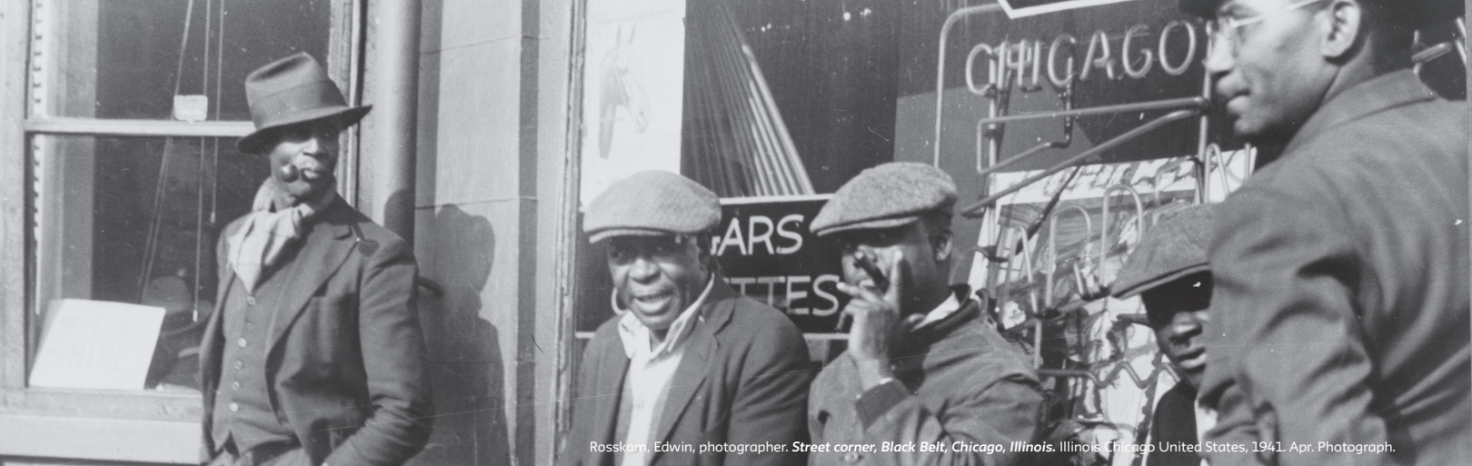
Street corner, Black Belt, Chicago, Illinois. Illinois Chicago United States, 1941. Apr. Photograph.