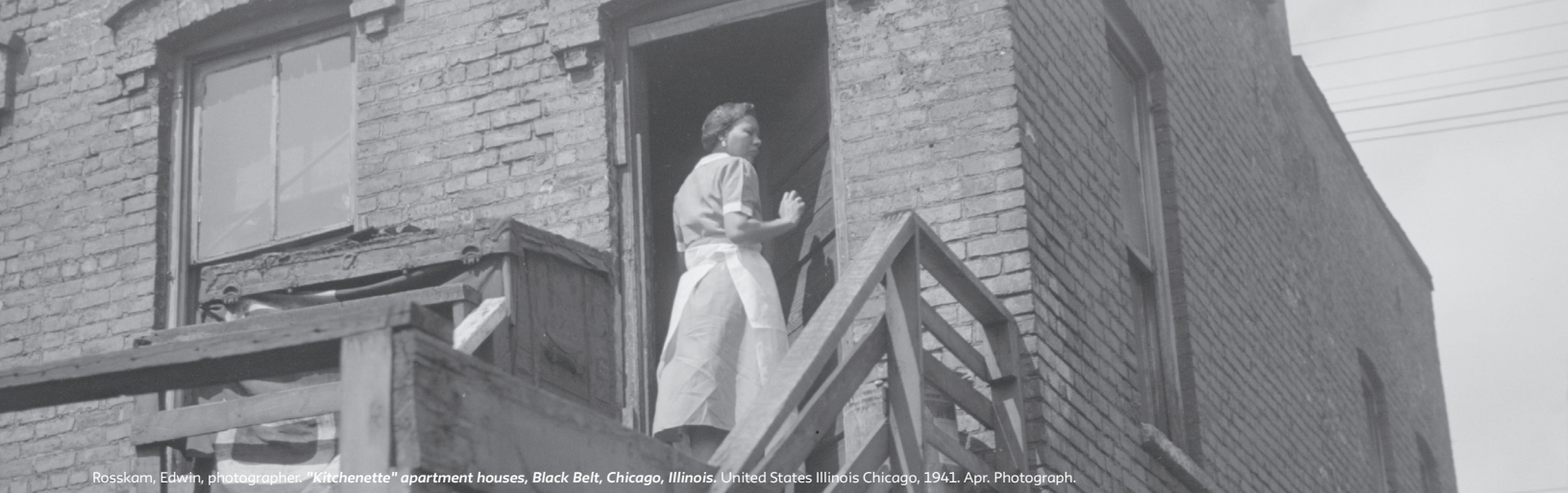
Roskam, Edwin, photographer. "Kitchenette" apartment houses, Black Belt, Chicago, Illinois, United States Illinois Chicago, 1941. Apr. Photograph.