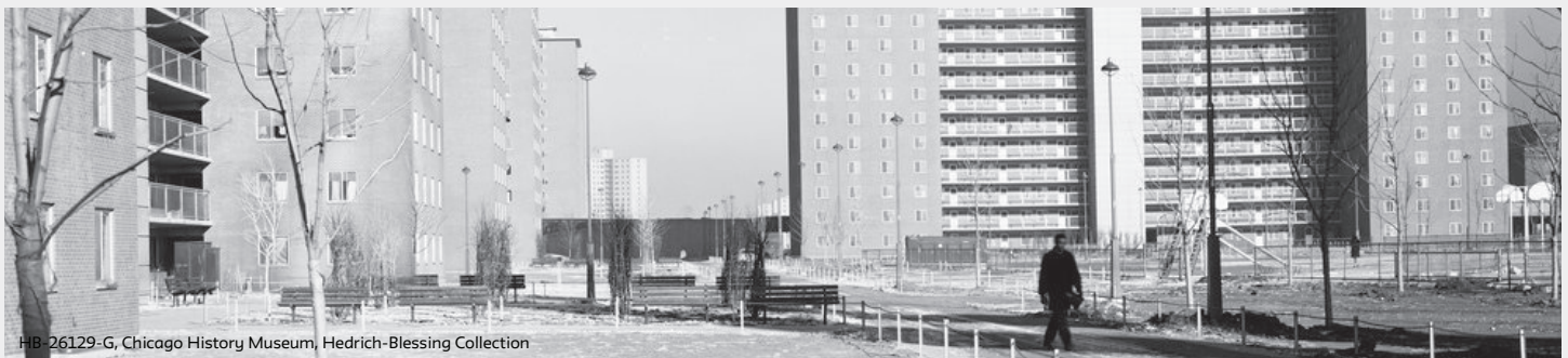
HB 26129-G, Chicago History Museum, Hedrich-Blessing Collection

Note: The difference in the percentage of noted groups as compared with the percentage of White families is statistically significant at the ***99%, **95%, *90% level.