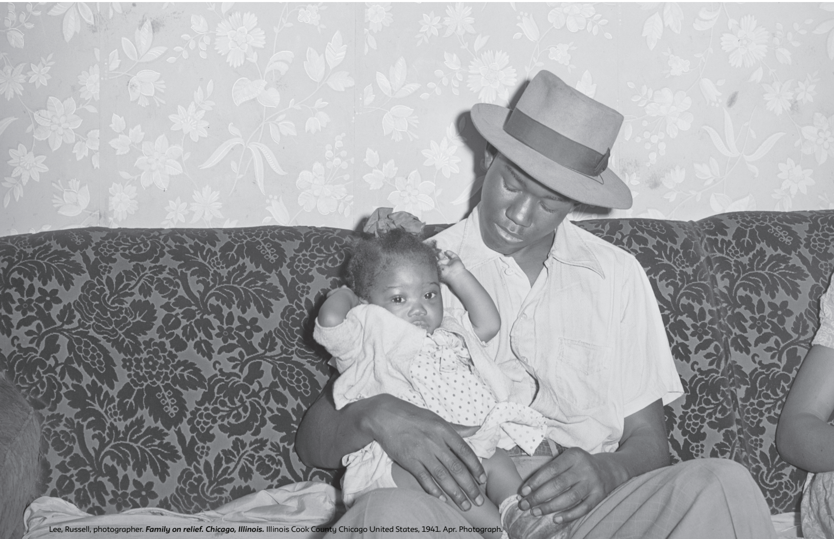
Family on relief. Chicago, Illinois. Illinois Cook County Chicago United States, 1941. Apr. Photograph.

When examining home values amongst homeowners, we found that the median home value for White families ($300,000) was the highest compared to other families, U.S. born Mexicans ($275,000), Puerto Ricans ($270,000), Blacks ($247,000). Foreign-born Mexicans had the lowest home values ($100,000)